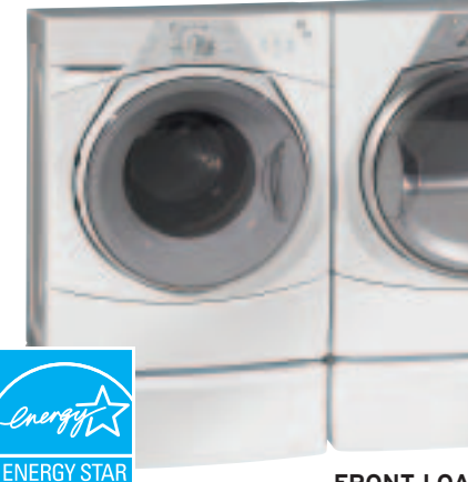
FRONT LOAD WASHER item #232560

The unit is also self cleaning, which means the elements can work more efficiently, and it has 3 inches of foam insulation to keep your hot water hot.