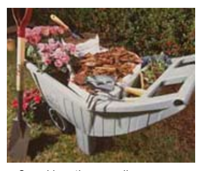
Spend less time weeding and watering.

Neatly mulched beds improve the appearance of any landscape. But beyond its appearance, a layer of mulch provides many other benefits. Mulch protects the plants' root systems and can add much-needed nutrients to the soil. Mulch slows the erosion of topsoil. Though applying mulch may seem like a chore, it can actually save you effort later in the season. Because mulch helps to prevent weeds and retain moisture, you'll spend less time weeding and watering your garden and more time enjoying it. In order for mulch to work and look its best, you must choose the best material for your garden and apply it properly. Lowe's is happy to provide this information as a service to you.