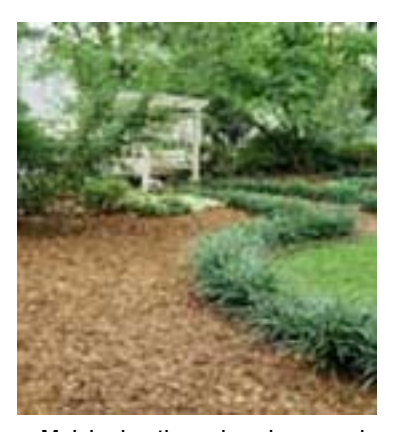
Mulched paths reduce lawn work.