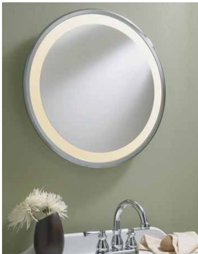
Portfolio Aphrodite Round Mirror •White back pan •Metal construction •Includes two F129 32-watt fluorescent bulbs •20" round •Includes mounting hardware #145754