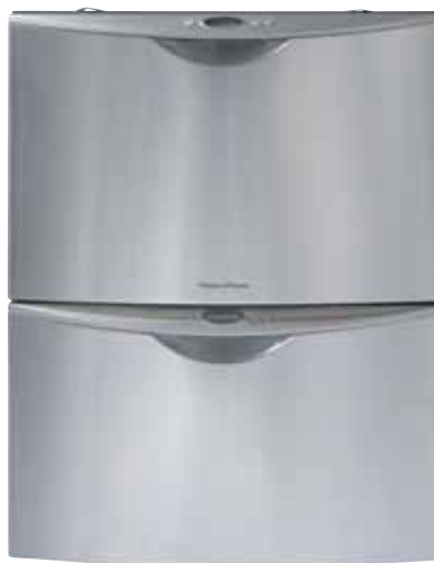
◀ Fisher & Paykel Double Drawer Dishwasher •Independent cycles per drawer #88076

Refrigerador Samsung Platinum •Clasificación Energy Star® •Dispensadores filtrados de agua y hielo en la puerta #162964