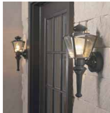
▲ Portfolio Coach Lantern Motion Light •Black finish •Solid brass construction •120-250 degree field of view #66494

Lámpara de mesa de Good Earth Lighting Laguna Niguel •Acabado de níquel cepillado •19 pulgadas #128843