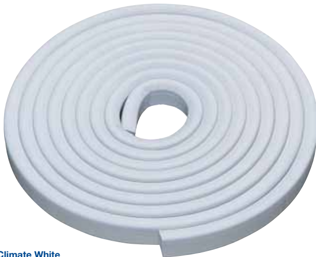
All-Climate White Weatherseal Weatherstrip •Seals out drafts, dust and moisture from around doors and windows •Reduces energy use, helps to lower utility bills •Guaranteed to remain flexible for 10-years •Easy self- adhesive installation #127947