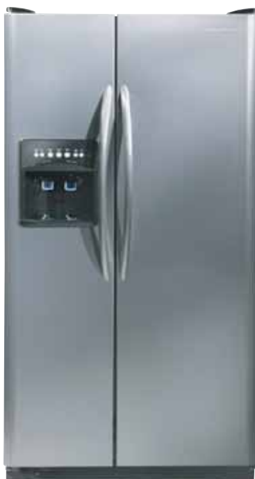
Frigidaire 26.2 Cu. Ft. Side-by-Side Refrigerator •3 spillsafe shelves •3 clear adjustable bins, 2 clear fixed bins •1 fresh lock 7 day meatkeeper #35041