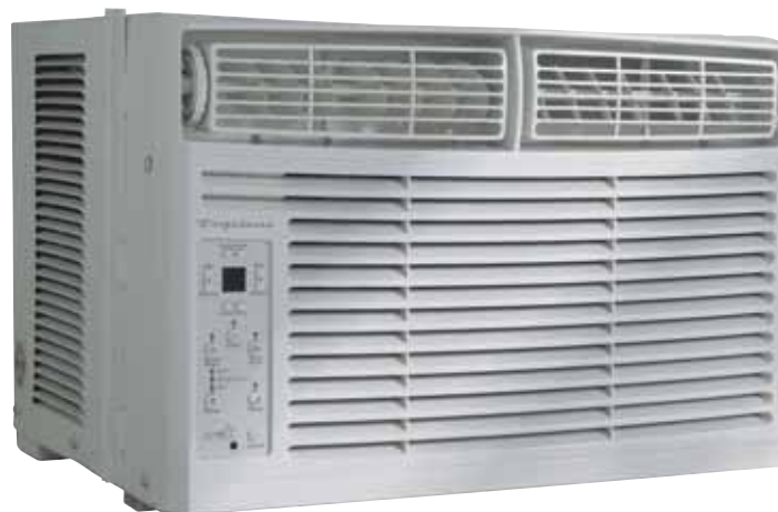
Frigidaire 6,000 BTU Air Conditioner •10.7 energy efficiency rating •Variable speed fan •115 volts •5-year warranty #205391

AIR CONDITIONERS: Lowe's offers a complete line of ENERGY STAR qualified air conditioners to cool your world inside while you help to protect your world outside from global warming. Replacing a 10-year-old room air conditioner with a new ENERGY STAR qualified unit can save up to $180 over its lifetime. ENERGY STAR qualified room air conditioners are 10% more efficient than conventional models by using high-efficiency compressors and fan motors.