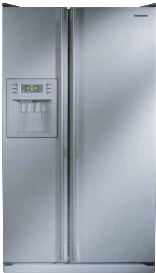
▲ Samsung Platinum Refrigerator •Energy Star® qualified •In-Door; filtered; water and ice dispensers #162964

Farol de iluminación por movimiento Portfolio Coach •Acabado en negro •Construcción de latón sólido •Campo visual de 120 - 250 grados #66494