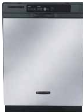
KitchenAid Stainless Steel Tall Tub Dishwasher •Hydro Sweep 5 Level™ •3 cycles •Whisper Quiet sound package #131596

The energy you save every year by purchasing a new ENERGY STAR qualified clothes washer over a new non-qualifying model is enough to run your television for nearly two months.