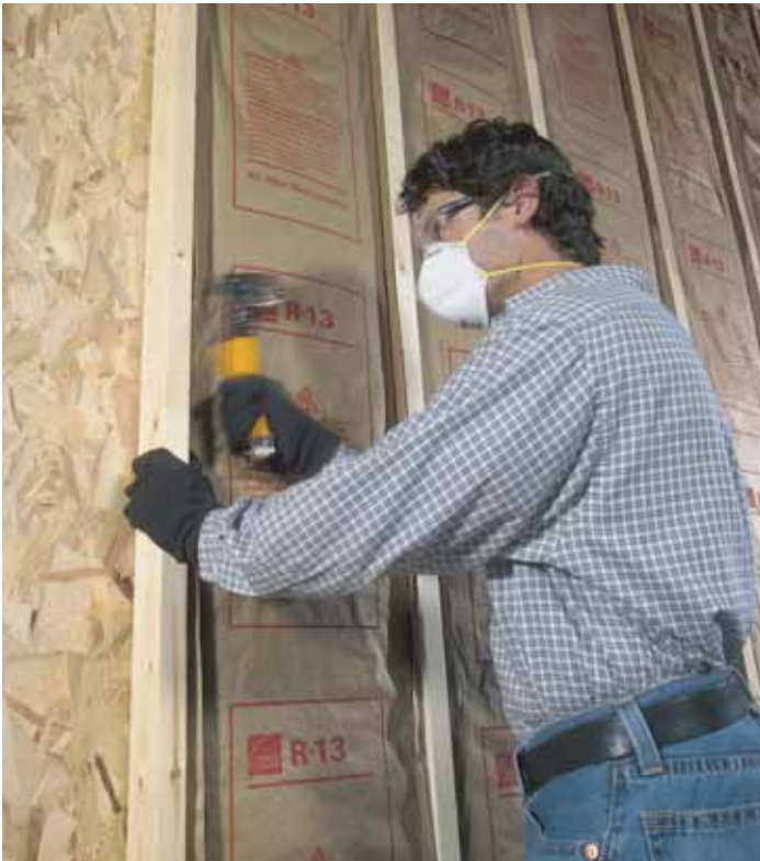
Owens Corning 3-1/2" Thick x 15" Wide Faced R-13 Insulation •40 sq. ft. roll •Ideal for insulating exterior walls, or any small project around the house •Helps control noise #13235

Caulk and weatherstrip your windows and add door sweeps beneath doors for added insulation. Take this test: if a playing card fits the crevice of an outside door or window, you need more weatherstripping.