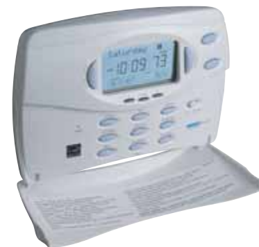
Hunter Fan Company 7-Day Heat Pump Programmable Thermostat •Up to 33 percent year round savings on energy costs •Multi-stage heat pump and 2-stage heat/cool compatible •Auto season changeover •INDIGLO® backlit display •Filter monitor •Temperature and vacation overrides •Low battery warning •2 AA battery backup #126373

AIR PURIFIERS: Comfort also means breathing easier, especially during allergy season. ENERGY STAR qualified room air purifiers use less energy to remove particles, such as dust and pollen from indoor air and are 35% more energy-efficient than standard models saving up to $200 over the life of the air cleaner.