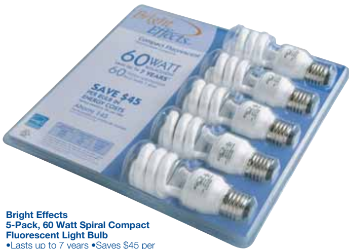
Bright Effects 5-Pack, 60 Watt Spiral Compact Fluorescent Light Bulb •Lasts up to 7 years •Saves $45 per bulb in energy costs #215996