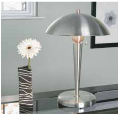
▲ Good Earth Lighting Laguna Niguel Table Lamp •Brushed nickel finish •19" #128843

Lámpara montada al ras de Good Earth Lighting •Acabado de níquel cepillado •15 pulgadas #128838