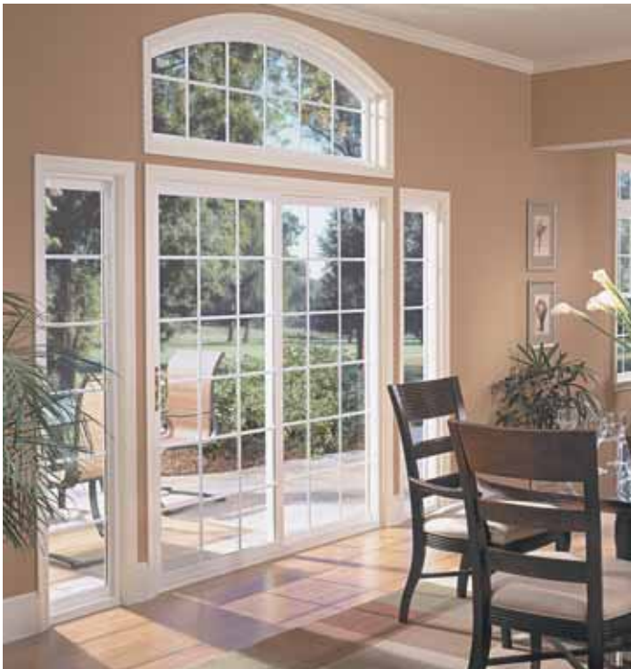
ThermaStar by Pella™ 6' 30 Series Vinyl Sliding Patio Door Unit •Profile grilles between the glass •Maintenance-free •Low-E insulating glass for energy efficiency •Fully weatherstripped for a tight seal •Screen included #116309