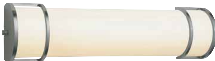
Portfolio Newcastle Bath Bar •White back pan and shade •Metal and acrylic construction •Includes two F14T5 fluorescent bulbs •24" x 6" x 8" #144747