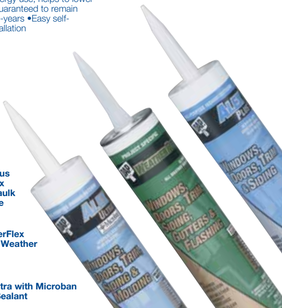
DAP Alex Plus Acrylic Latex Adhesive Caulk Plus Silicone #219876