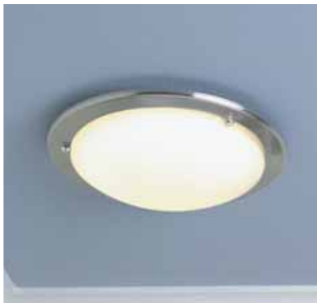
▲ Good Earth Lighting Flushmount Light Fixture •Brushed nickel finish •15" #128838

Lámpara montada al ras de Good Earth Lighting •Acabado de níquel cepillado •15 pulgadas #128838