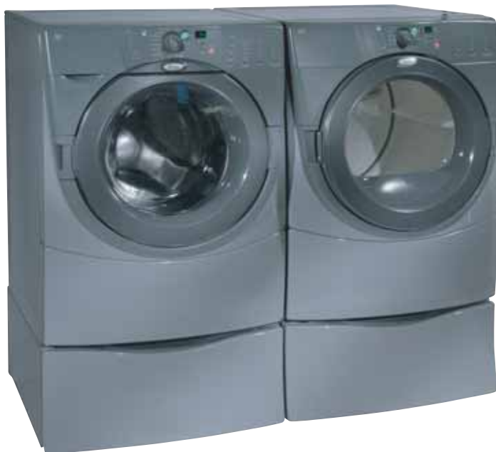
Whirlpool 3.8 Cu. Ft. Ultra Capacity Front Load Washer •Stainless steel tub •Automatic H2P levels •1000W Heater •Variable end of cycle signal •Up to 12 hr. delay wash options •1100-1200 RPM spin speeds #91283