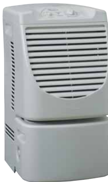
Whirlpool 40 Pint, 7.5 Amp Dehumidifier •40 pints per day •AccuDry™ system •Automatic de-icer •Adjustable humidistat #196859

DEHUMIDIFIERS: ENERGY STAR qualified dehumidifiers have more efficient refrigeration coils, compressors, and fans than conventional models, so they use at least 10% less energy to remove moisture than a similar size conventional unit. Depending on the size of your dehumidifier, ENERGY STAR can save about $110 on electricity costs over its lifetime-paying for itself in energy savings.