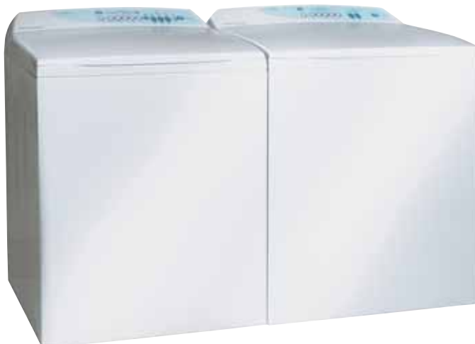
◀ Fisher & Paykel Super Capacity Washer •1,000 rpm spin speed for faster drying •9 cycles #107526

Lavadora de gran capacidad Fisher & Paykel •Exprimido con una velocidad de 1.000 rpm para un secado más rápido •9 ciclos #107526