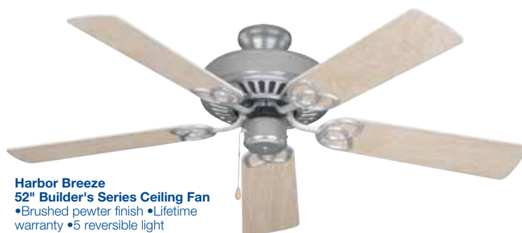
Harbor Breeze 52" Builder's Series Ceiling Fan •Brushed pewter finish •Lifetime warranty •5 reversible light maple/mahogany blades •Light kit adaptable #54108